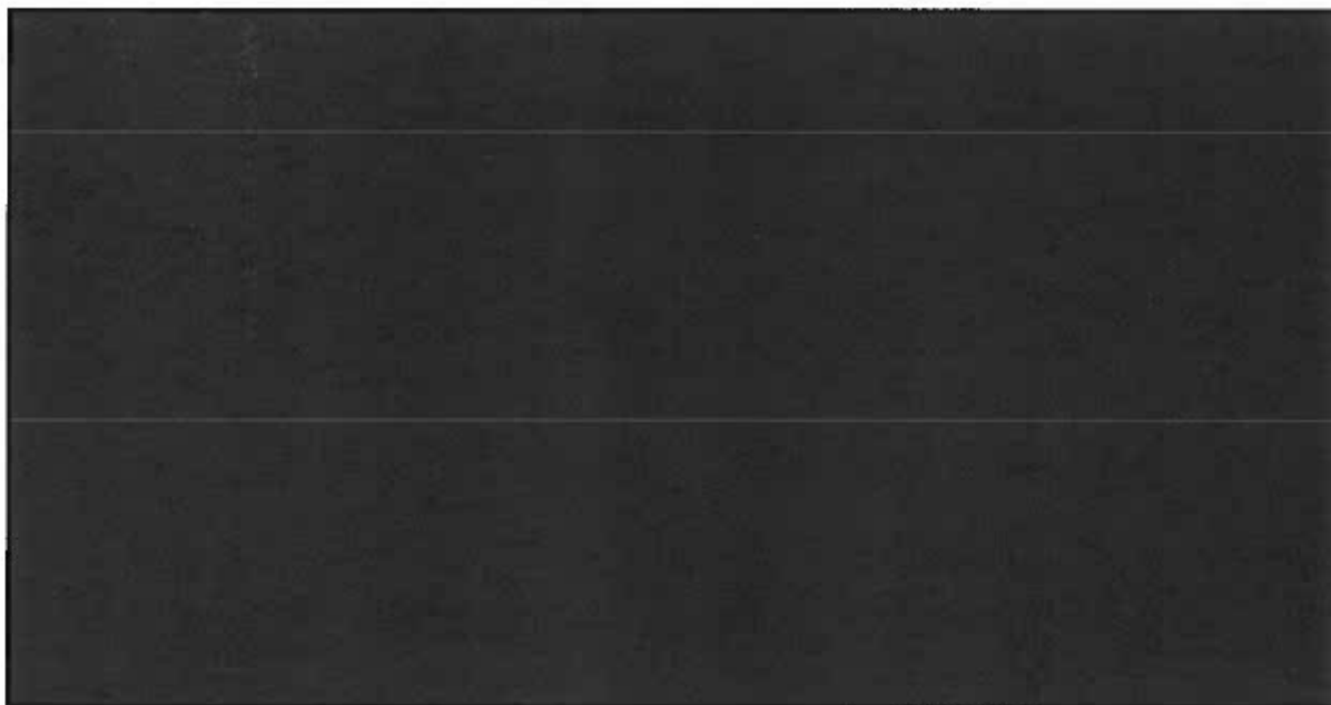
TABLE 3.2 Records Requested in Section 215 Orders Filed on Behalf of FBI Issued in 2007 through 2009

We compiled the types of business records that were sought in the ██████████ Section 215 orders filed on behalf of the FBI. Table 3.2 shows the types of records identified in the Section 215 orders, as well as the number of requests for each type of record.